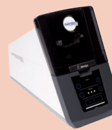
Minilys® for personal use