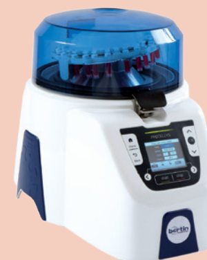
Precellys® Evolution Super Homogenizer