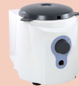
Cryolys® for sensitive molecules