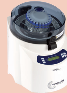
Precellys® 24 for high throughput